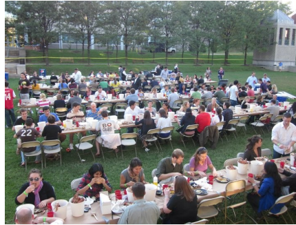
Students chowing down at Crab Fest.